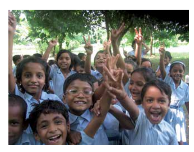
Children at Vidya