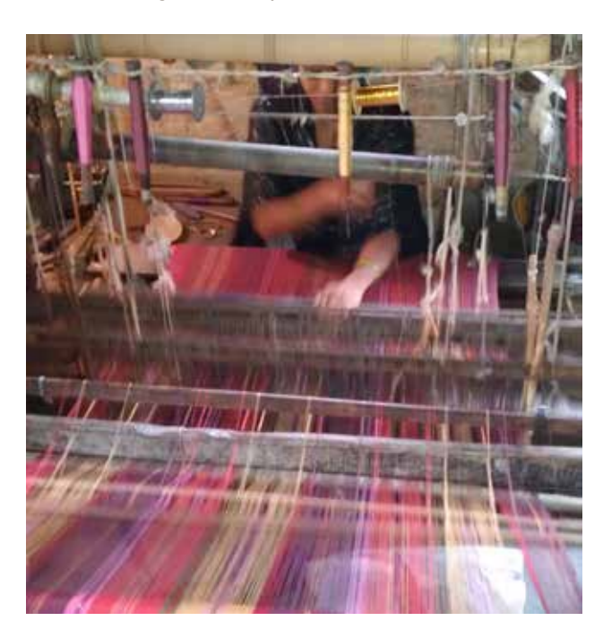
Weaver using a hand loom

This project started in 2011 and is being delivered by ASK, a not for profit organisation specialising in grass roots community development.