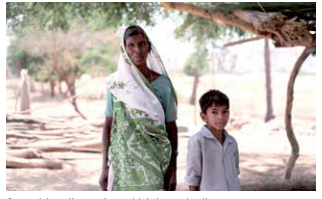
Seva Mandir project, Udaipur, India