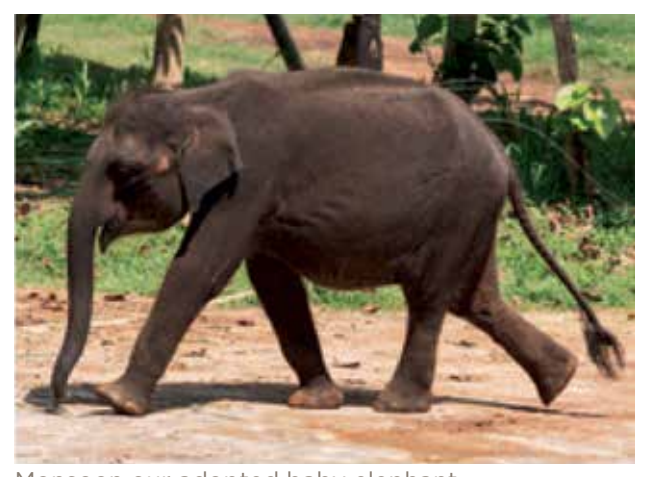
Monsoon our adopted baby elephant