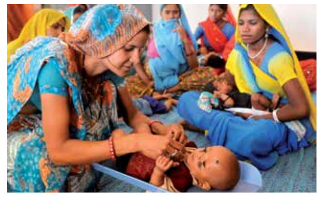
Women with children at the clinic