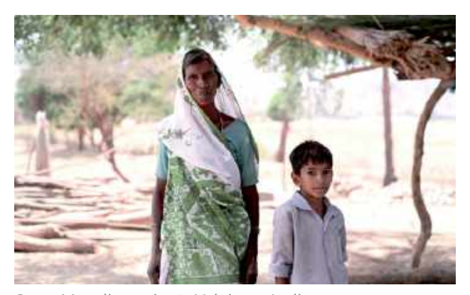
Seva Mandir project, Udaipur, India