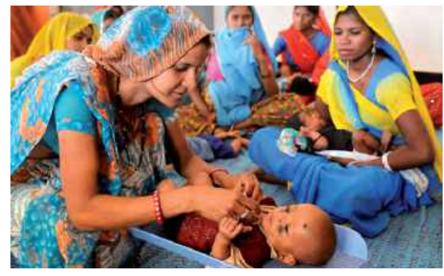
Women with children at the clinic