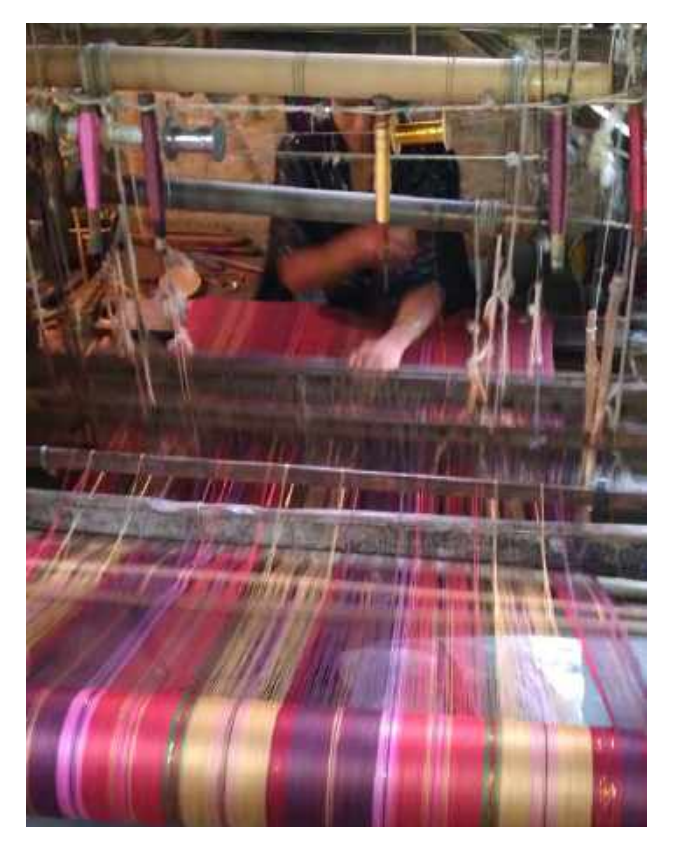
Weaver using a hand loom

This project started in 2011 and is being delivered by ASK, a not for profit organisation specialising in grass roots community development.