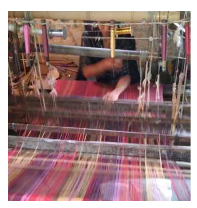
Weaver using a hand loom

This project started in 2011 and is being delivered by ASK, a not for profit organisation specialising in grass roots community development.