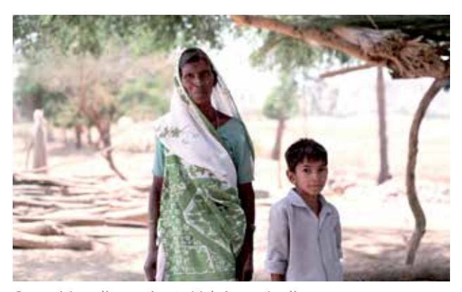
Seva Mandir project, Udaipur, India