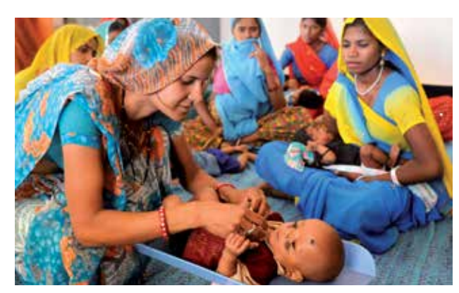
Women with children at the clinic