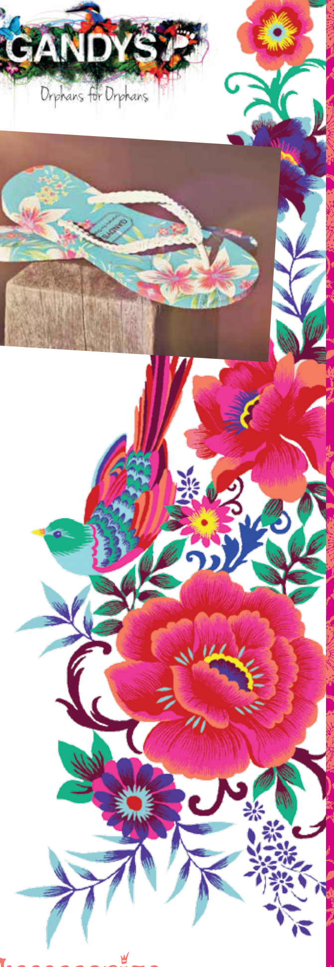
MONSOON · Accessorize